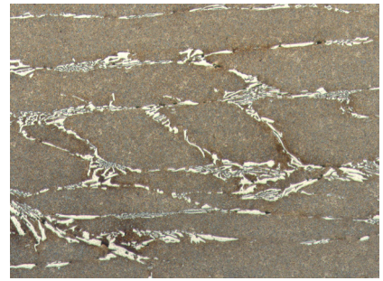
Fig. 3. Hot-working problems on a D2 roll

In addition to a large number of inclusions, cracking during solidification and hot working may introduce flaws that